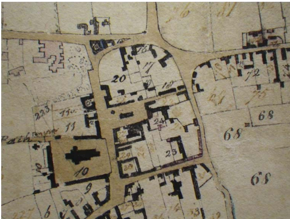
W.H. Youngs' Map of Mildenhall 1834 shows the house with additional ranges (no longer extant) attached to the front of the building (RO ref EF 505/1/82)

Finds: Medieval and early post-medieval CBM