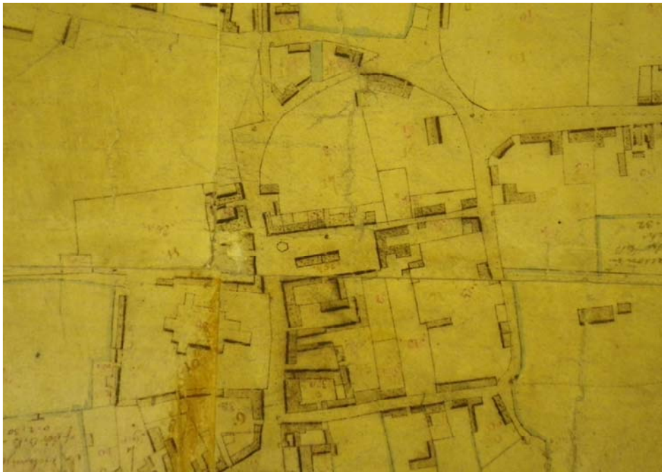
Mildenhall Enclosure Map 1812 showing what appears to be Shrubland House already in existence (Bury RO ref 260/B/P1)