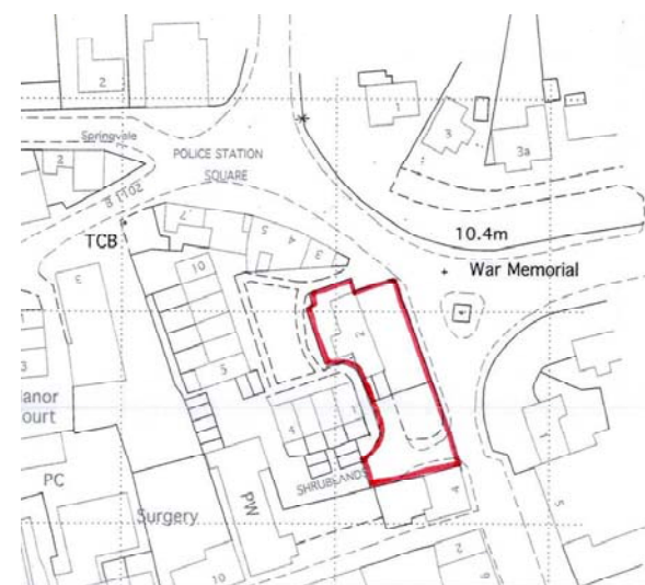
Fig 1 Location Map: